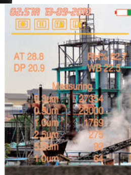
Fold reading on the images