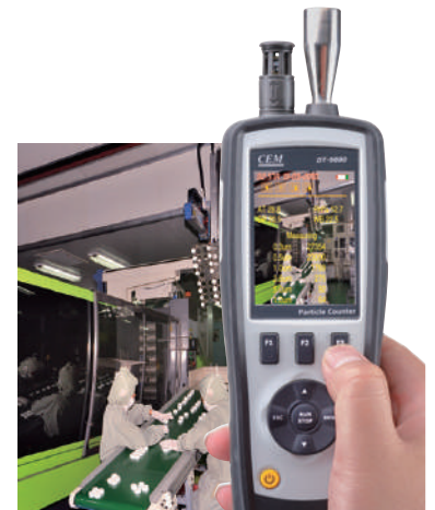
JPG images/AVI videos