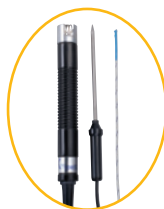
Temperature probe (Optional: NR-31B / TP-500 / TCP-100)